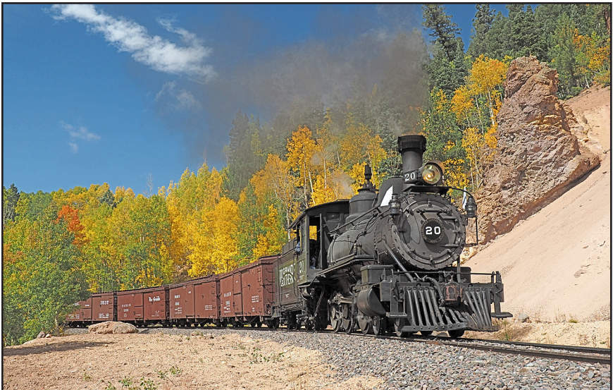
RGS 20 at Calico Cut on the C&TS, on September 29, 2021, on a charter organized by Lerro Photography.