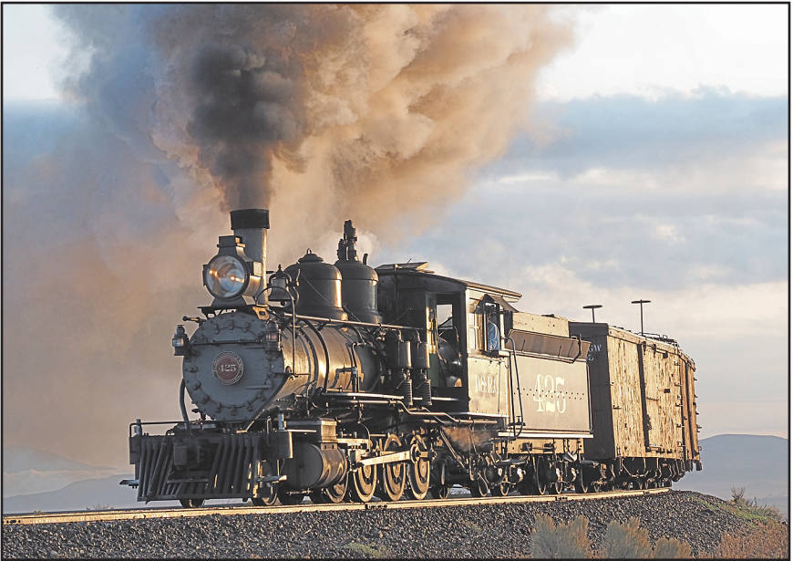
D&RG 315 (renumbered as 425) at Lava Tank on the C&TS on the morning of September 28, 2021, on a charter organized by Lerro Photography.